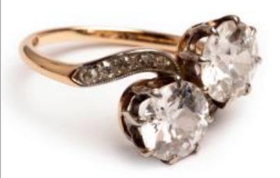
Sold for £8,000 A 20th Century diamond ring