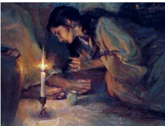
Jesus is anointed by Mary at Bethany

Almighty God, in Christ you make all things new: Transform the poverty of our nature by the riches of your grace, and in the renewal of our lives make known your heavenly glory; through Jesus Christ our Lord. Amen