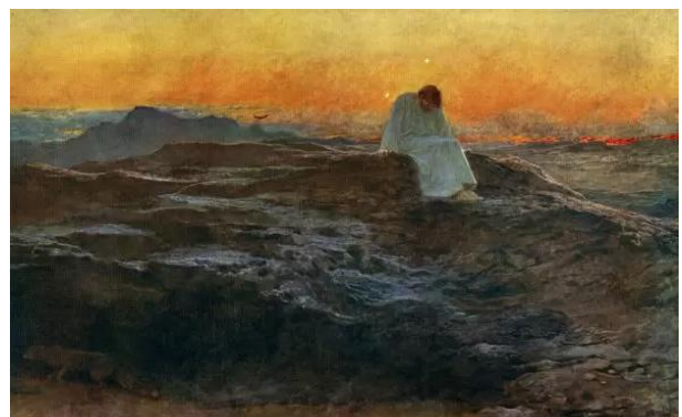
Christ in the Wilderness

Glory to God the Source of all being, Eternal Word and Holy Spirit, as it was in the beginning, is now and shall be forever. Amen.