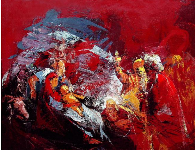
The Visit of the Magi

During this season, through the visit of the Magi, his baptism, the first miracle at Cana, and his presentation at the Temple, we see Christ revealed to us as the Son of God.