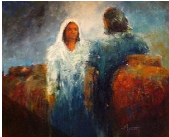
The First Miracle at Cana