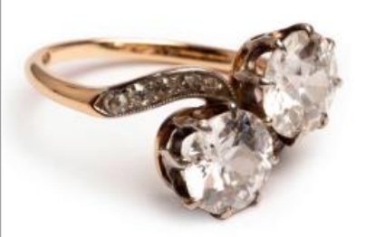
Sold for £8,000 A 20th Century diamond ring