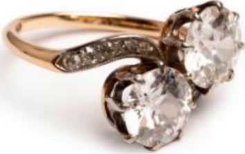
Sold for £8,000 A 20th Century diamond ring