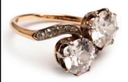
Sold for £8,000 A 20th Century diamond ring