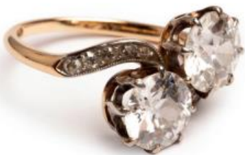
Sold for £8,000 A 20th Century diamond ring