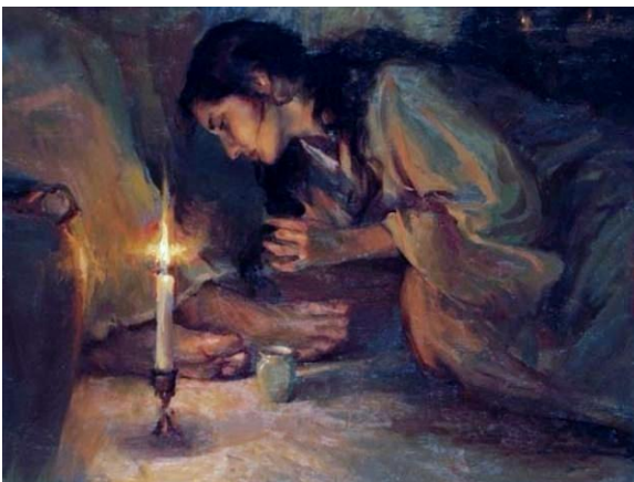
Jesus is anointed by Mary at Bethany

Almighty God, in Christ you make all things new: Transform the poverty of our nature by the riches of your grace, and in the renewal of our lives make known your heavenly glory; through Jesus Christ our Lord. Amen