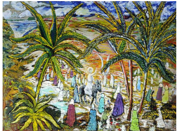
The Triumphant Entry

Our Father in heaven, hallowed be your name, your kingdom come, your will be done, on earth as in heaven. Give us today our daily bread. Forgive us our sins as we forgive those who sin against us. Lead us not into temptation but deliver us from evil. For the kingdom, the power, and the glory are yours now and for ever. Amen.