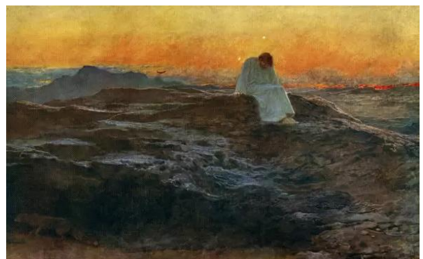
Christ in the Wilderness

Glory to the Father and to the Son and to the Holy Spirit; as it was in the beginning is now and shall be for ever. Amen.