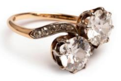
Sold for £8,000 A 20th Century diamond ring