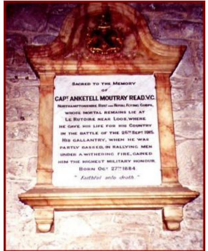
Memorial in Bampton Church, Devon