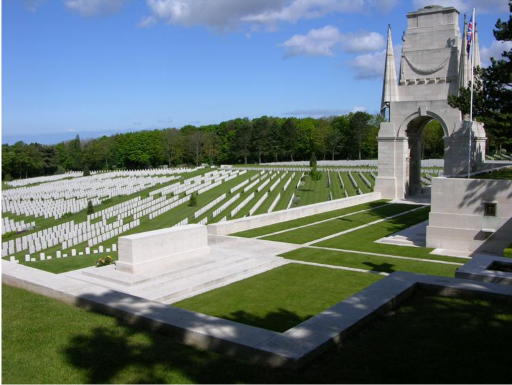
Etaples Military Cemetery, where Douglas Reynolds is buried