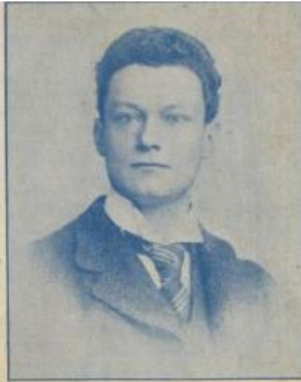
Photograph taken from an election poster