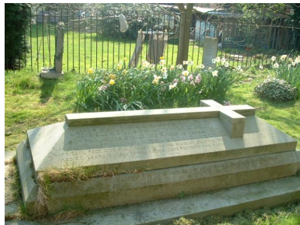
Douglas Gabell's grave in St Lawrence's Churchyard, Swindon Village